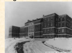
12th Ave. VA Hospital, 1932-1961