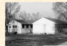
Temporary Nursing building, 430, used until 1969