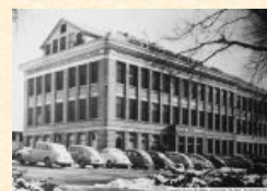
Medical School Building 1920-1965