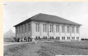
Gymnasium, in 1906 Also housed the College of Pharmacy 1942-1966