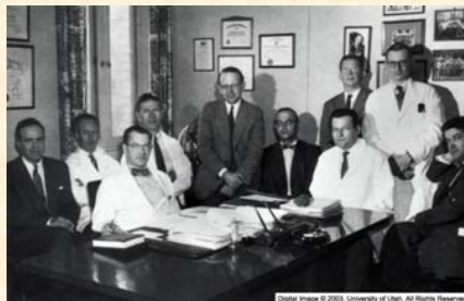
The "Quorum" at the School of Medicine, 1956